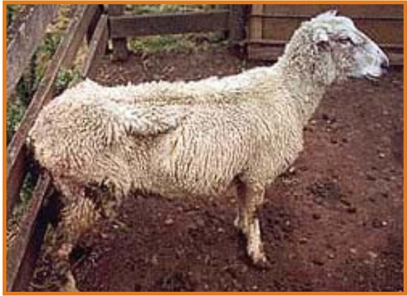
A sheep showing symptoms of Johne's disease.

Since the signs of Johne's disease are similar to those for several other diseases—parasitism, dental disease and caseous lymphadenitis (CLA), laboratory tests are needed to confirm a diagnosis.